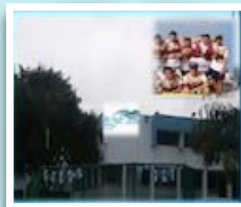
Tichon Achiya Herzliya

Tichon Achiya is a Torahani Boys Maritime Junior High and High school located in Herzliya.