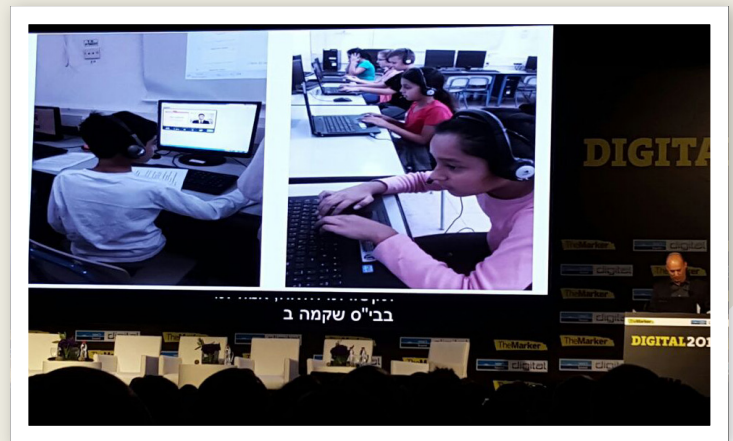
THE MINISTER OF EDUCATION - 2016